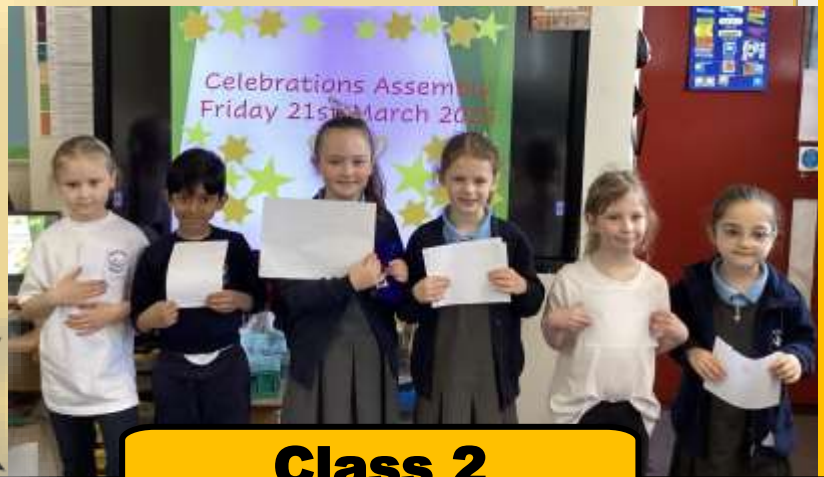
Class 2 Stars