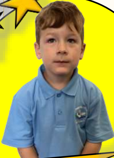
Class 1 STAR OF THE WEEK

Well done to all the children that received an award this week.