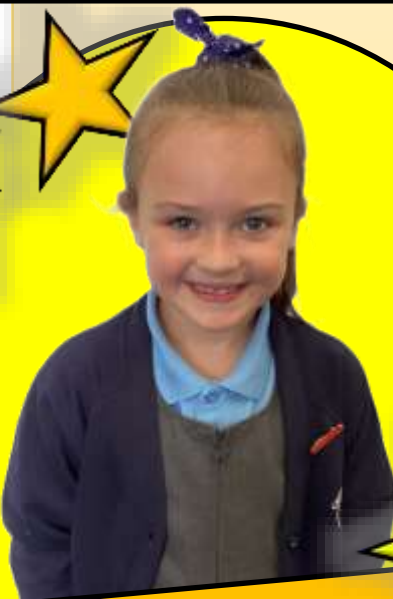
Class 2 STAR OF THE WEEK