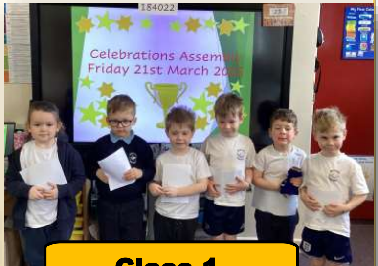
Class 1 Stars