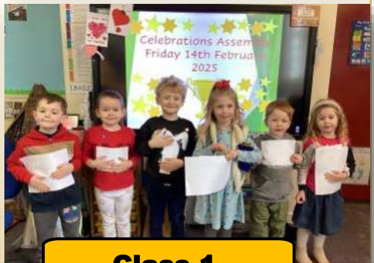
Class 1 Stars