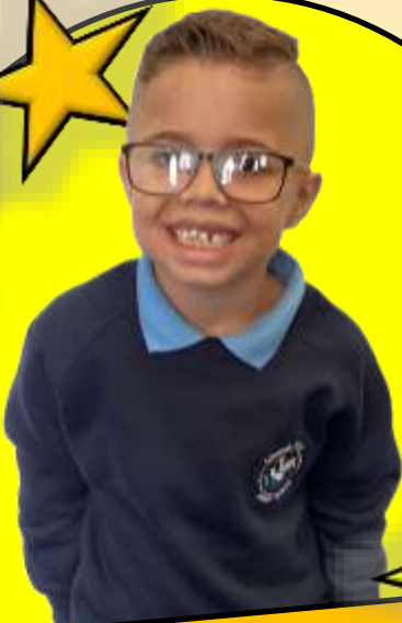
Class 2 STAR OF THE WEEK