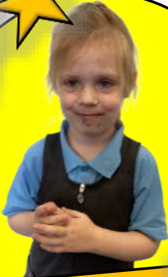
Class 1 STAR OF THE WEEK

Well done to all the children that received an award this week.