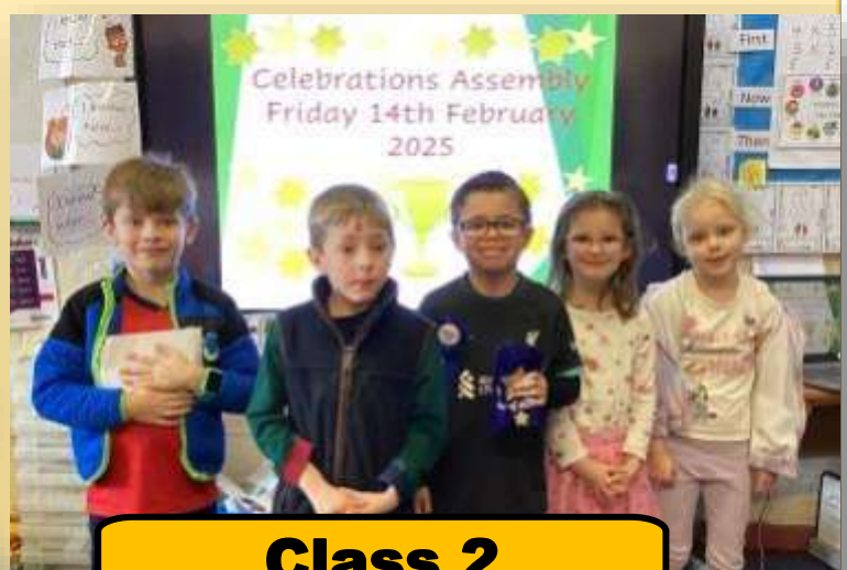
Class 2 Stars