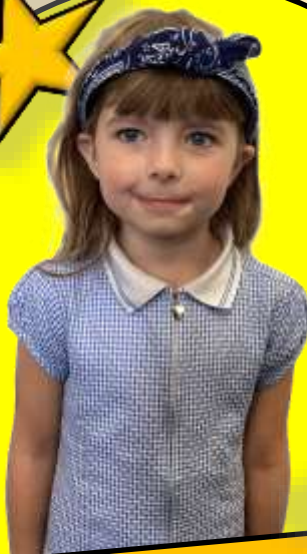
Class 2 STAR OF THE WEEK