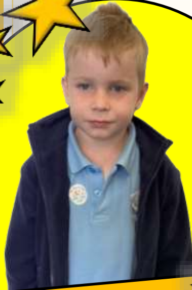
Class 1 STAR OF THE WEEK

Well done to all the children that received an award this week.