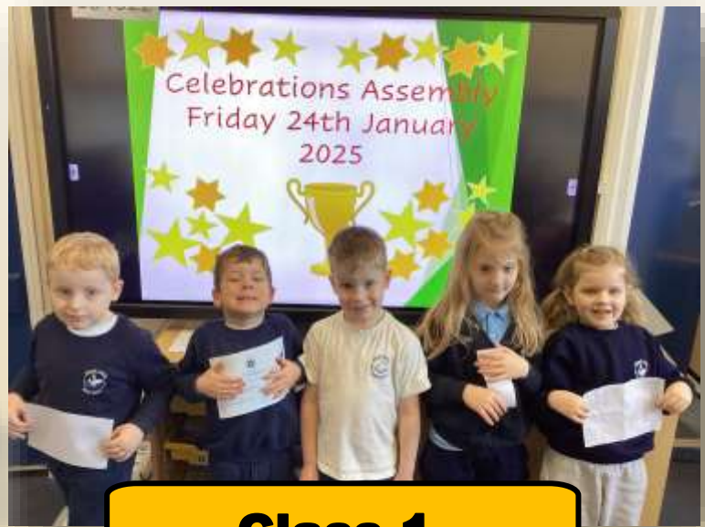
Class 1 Stars