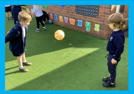
We have been practising bouncing a ball in P.E