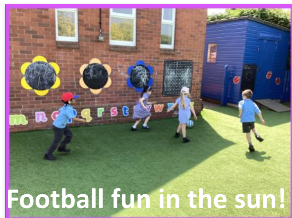
Football fun in the sun!