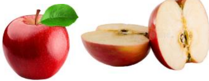
The whole part, part

The year 1 children have been busy looking at pieces of fruit as a whole and cutting it into parts. This will lead into learning in the near future when we will talk about part, part whole models.