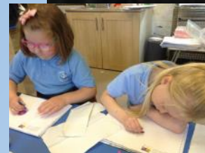
In Art the children started to learn about the artist Wassily Kandinsky.