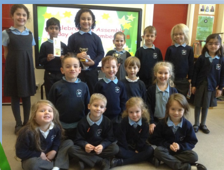
The winning team is GREEN For this week!

Congratulations to all the children that have received an award this week.