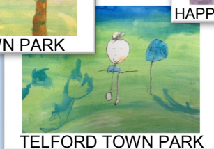
TELFORD TOWN PARK