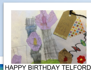
HAPPY BIRTHDAY TELFORD