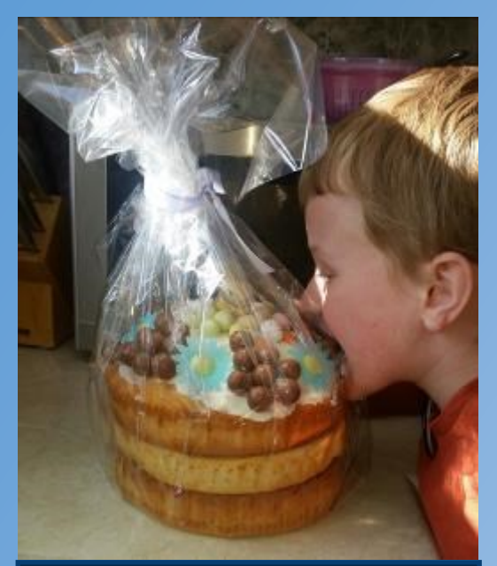
Munch, Munch...that looks chocolicious!

We have loved seeing all the wonderful photos of your children enjoying their home school learning. We will continue to share them here so please keep sending them to us.